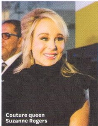
Couture queen Suzanne Rogers