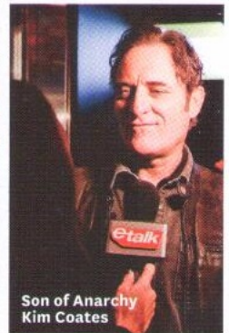
Son of Anarchy Kim Coates