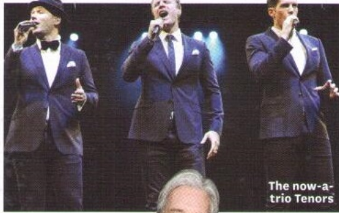
The now-a-trio Tenors